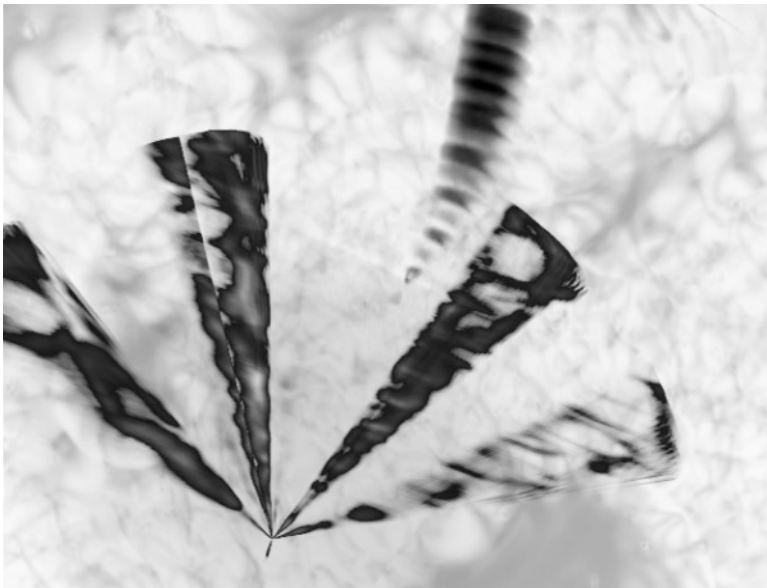
Figure 2. A twirling complex of obliquely-lit cones.

A central audio and visual “image” in the work is a simple recurring ticking figure. In this case, I created an animation scene with a set of six cones with their tips meeting, lit obliquely from the side with a virtual spotlight containing a Quicktime movie of vibrating water. The cones rotate around their meeting point, seemingly impelled forward by the clicks and gaining speed as the ticks gain speed and intensity. The behavior of the cone-complex is clearly triggered by the audio events, but seems to take on its own momentum as a result of that triggering. (See Figure 2.)